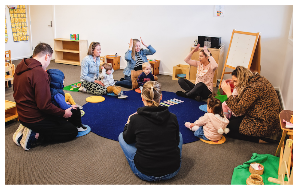
Our Toddler and Transition Playgroup inspires and empowers children and parents alike.

The Montessori approach is embedded in every stage of this journey. Our children explore the curriculum areas of Practical Life, Sensorial, Maths, Language and Cultural Studies. Each child engages with specialised materials to inspire their self-directed learning and benefit from the intentional teaching of our highly-skilled and attentive educators.