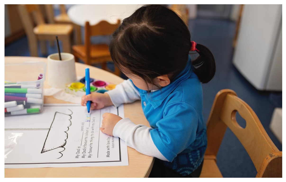
Our Preschool program (including the kindergarten year) nurtures the holistic needs of the child.

Please note that the Commonwealth Childcare Subsidy does not apply to the Toddler Transition programs. For subsidized toddler care we are able to accept a limited number of two-year-old children into our Preschool program.